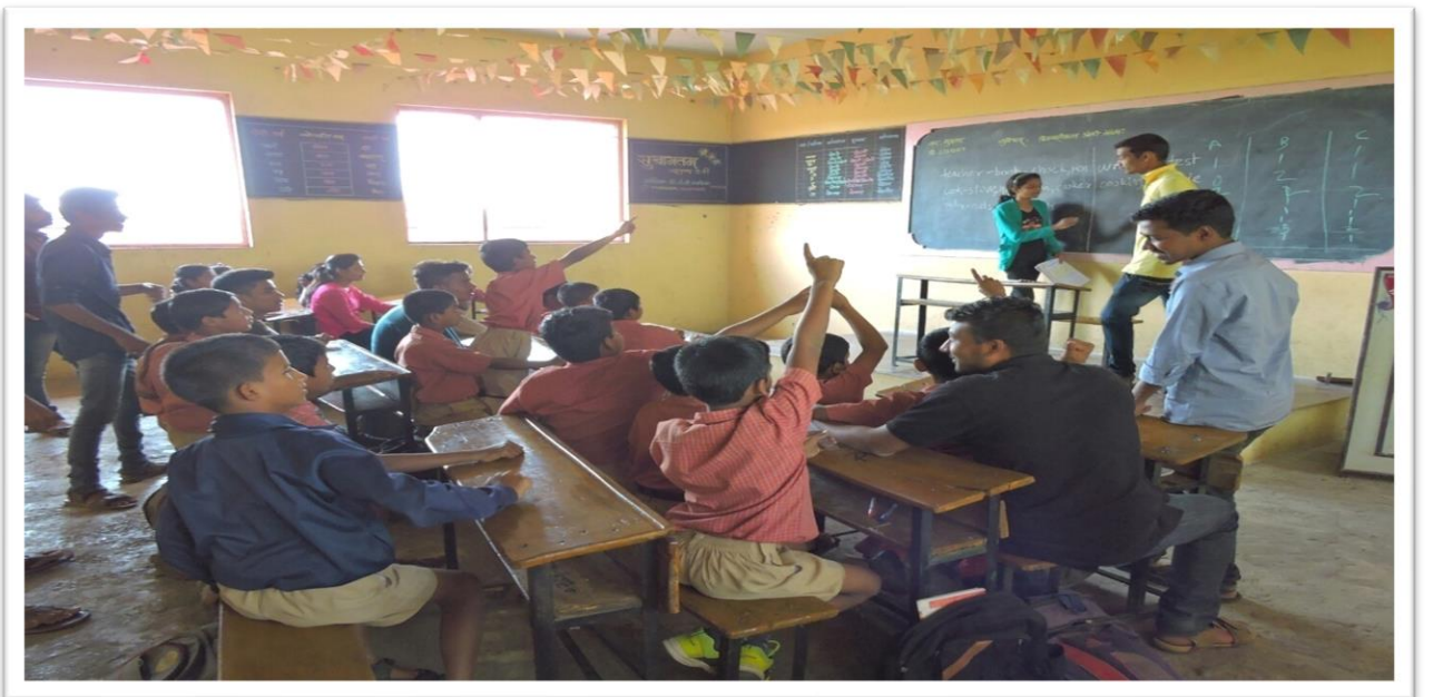
Teaching Lessons by NSS Volunteers