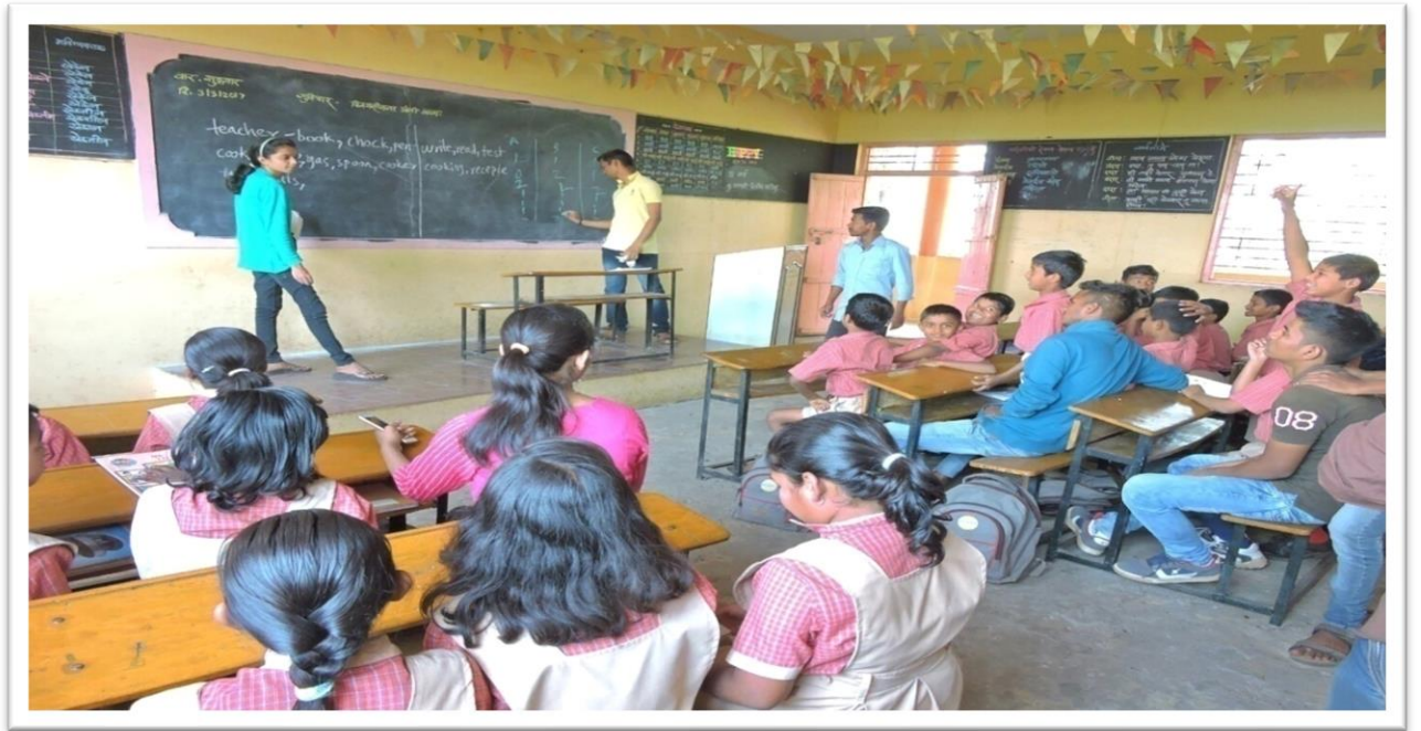
Teaching Lessons by NSS Volunteers.